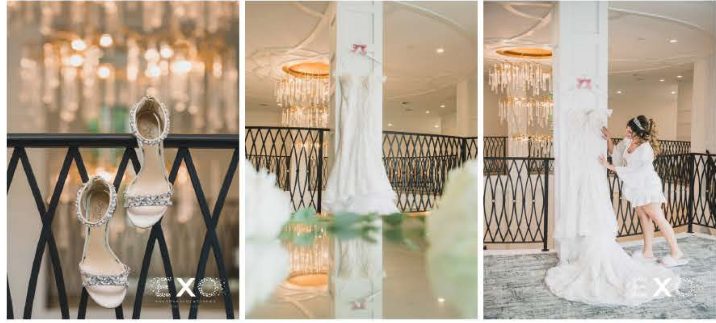
Water's Edge wedding photos of the bride's shoes, gown, bouquet, and getting ready